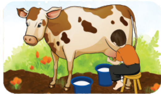
Milk yielded by a cow

Animals are used for driving tongas and ox carts. Tongas are used for travelling. Donkey cart and ox cart are used to transport luggage from one place to another. Leather is made from the skin of animals. Shoes and bags are made from leather. Milk and meat are also obtained from animals.