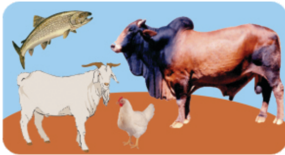
Meat producing animals