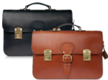
Bags made of leather